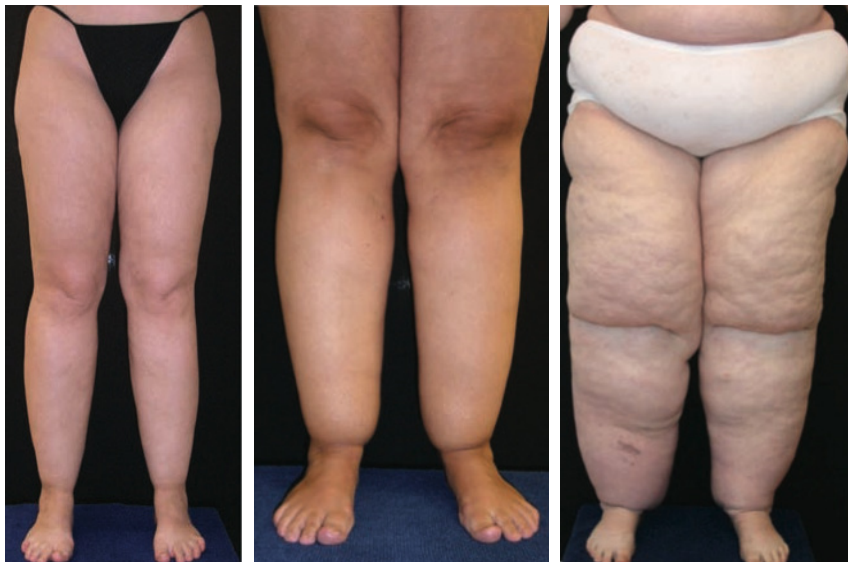
Figure 1. Mild (left) moderate (centre) and severe (right) lipoedema